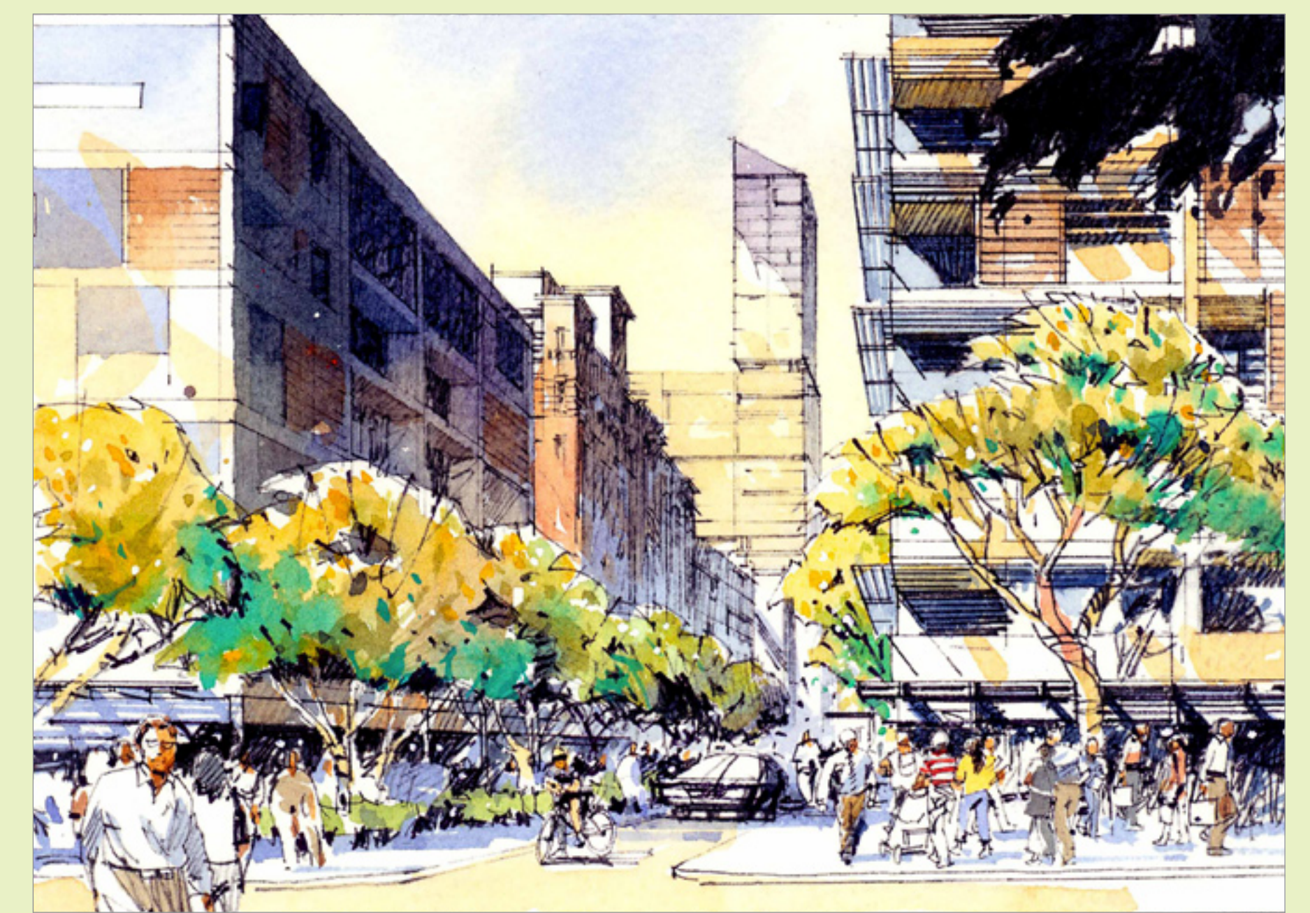
Perspective Sketch, Blackfriars.

More than 40% of the site to be accessible to the public including parks, open space and other public areas.