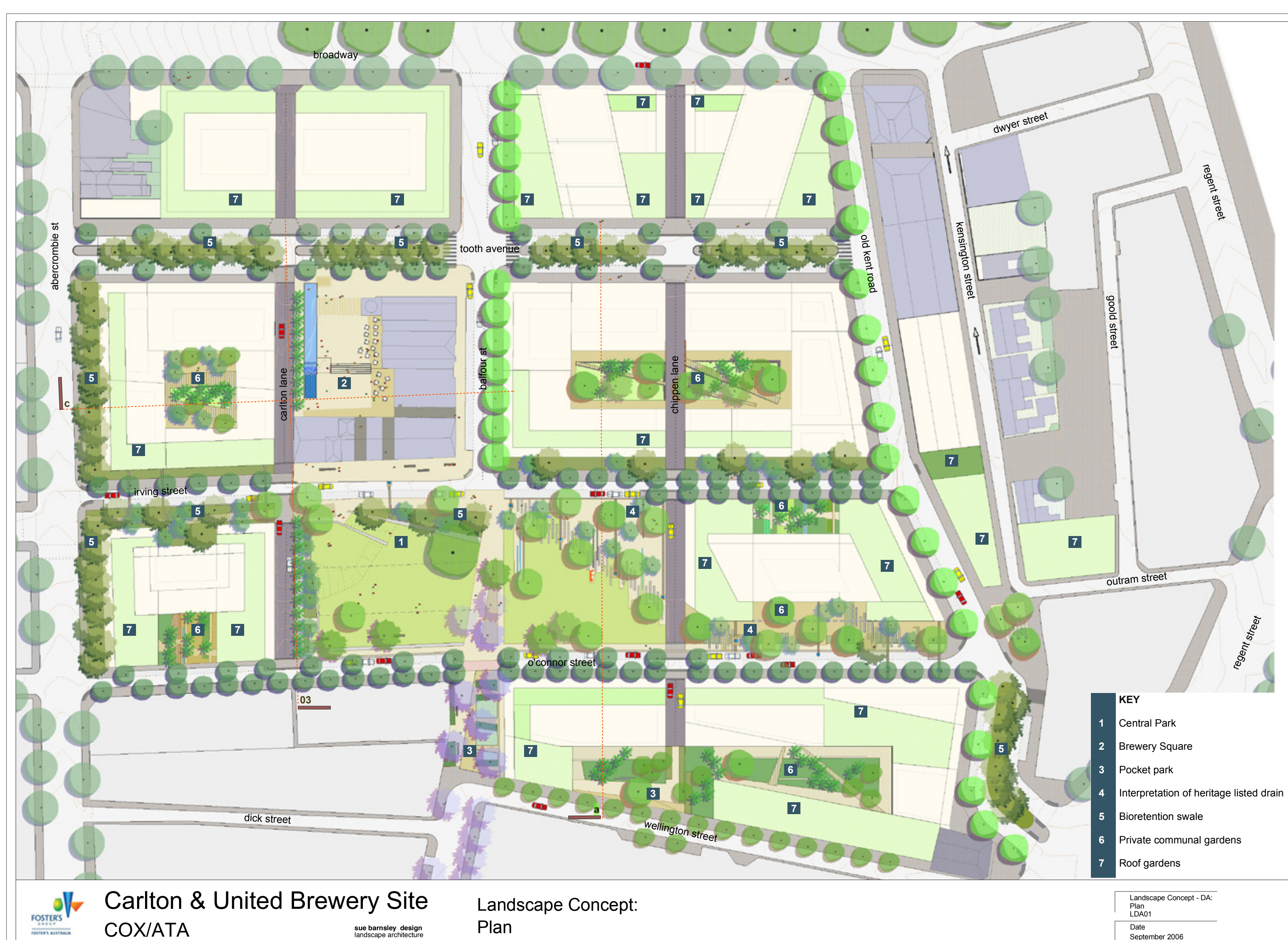
Indicative landscape plan.